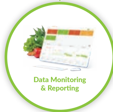
Data Monitoring & Reporting